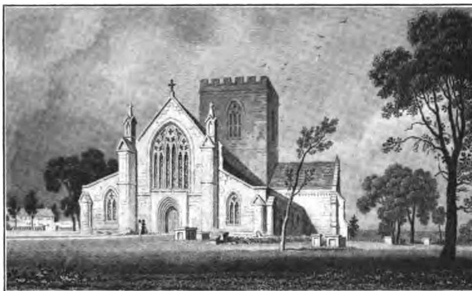
ST. ASAPH CATHEDRAL